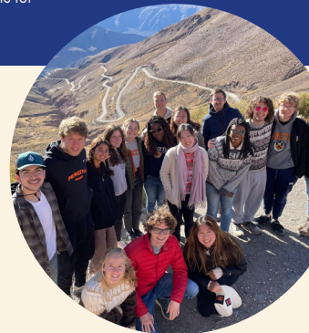
Princeton in Argentina

Graduating seniors seeking postgraduate support may wish to consider the Martin A. Dale '53 Fellowship or the Henry Richardson Labouisse '26 Prize. The Office of the Dean of the College publishes a complete list of postgraduate fellowship opportunities.