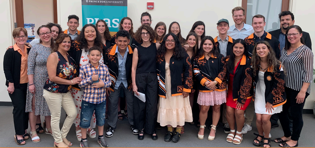
PLAS Class Day 2023 UNDERGRADUATE CERTIFICATE PROGRAM

PLAS offers two tracks of study: Latin American studies and Brazilian studies.